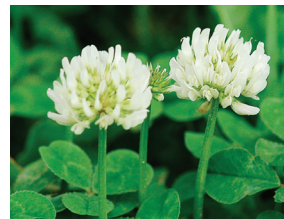
New Zealand White Clover