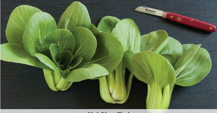
Mei Qing Choi