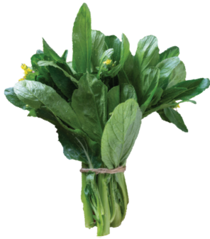
Green 70 D Improved