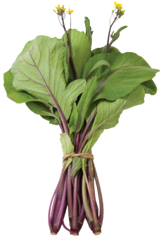
Hon Tsai Tai