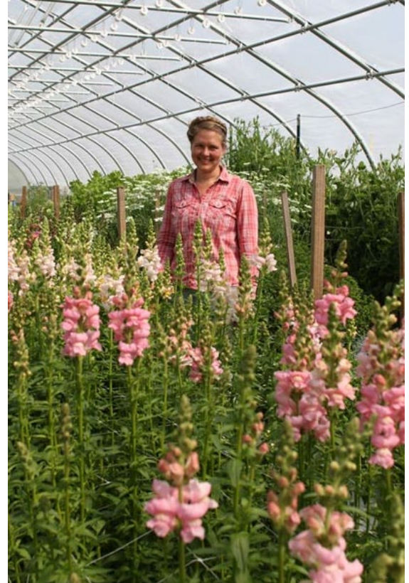
Snapdragons can be grown in either the field or a protected growing environment. Crops grown in a greenhouse or tunnel produce higher quality blooms and stems.

The Johnny's website includes the group designation in the product description for each snapdragon variety that we sell. For more information on snapdragon groups and how to time your plantings by group, read our article at: Johnnyseeds.com/snapdragon-groups