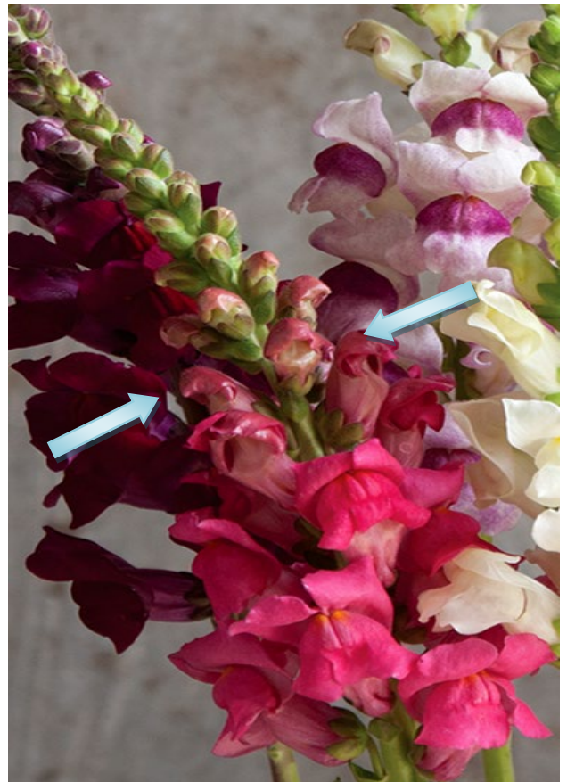
Snapdragons are ready to harvest when the blooms on the lower third to half of the spike are open.

Snapdragon blossoms are edible and can be used as to garnish salads, desserts, and drinks. Flavor is floral and slightly bitter.