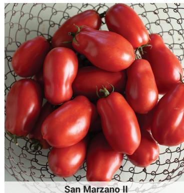
San Marzano II