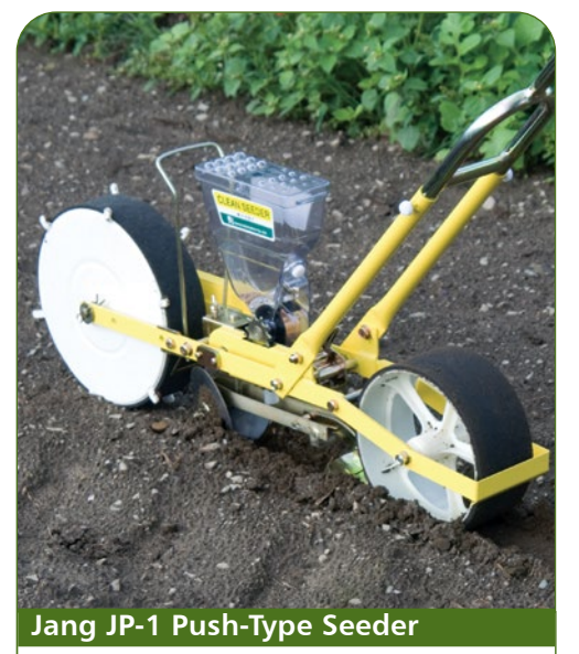
Product #:7319 Precisely singulates very small to medium-size raw and pelleted seed. Optimizes spacing, saves seeds, and reduces labor. A multitude of quick-change rollers available for different seed sizes and spacings. Seed rollers sold separately.