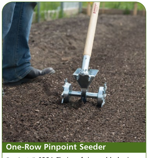
Product #:9284 Choice of six seed-hole sizes on two included shafts.