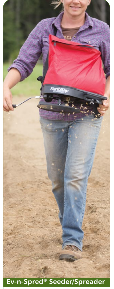
Product #:9264 Holds up to 20 lb. Spread width up to 30".