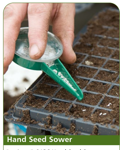
Product #:9136 Hand Seed Sower

Product #:9594 Mini Wand Seeder. Product #:9055 Mini Wand Seeder with Air Valve/Hose.