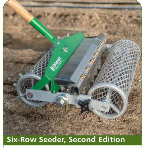
Product #:6758 21/4" row spacing. Product #:9454 Six-Row Extended Range Shaft