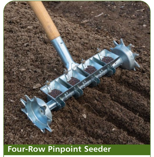
Product #:9285 for greenhouse planting of small to medium-size seed. 21/4" row spacing.