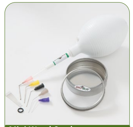
Mini Wand Seeders

Product #:9594 Mini Wand Seeder. Product #:9055 Mini Wand Seeder with Air Valve/Hose.