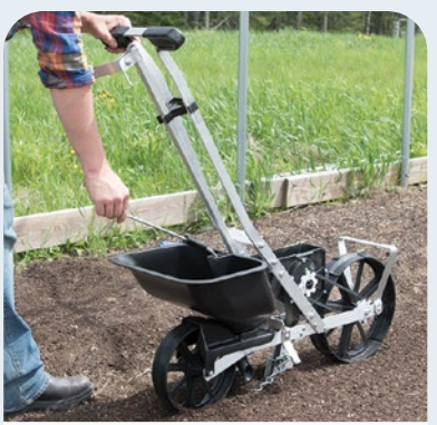
Earthway® Fertilizer Attachment