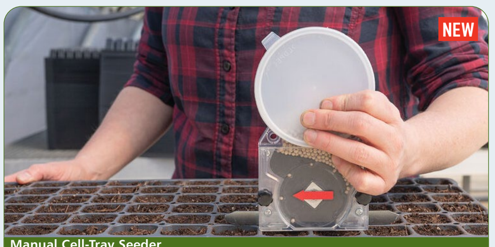
Manual Cell-Tray Seeder

Product #:8367 Sows round and pelleted seed with incredible speed! Compatible with 50, 72, 128, and 200-cell trays.