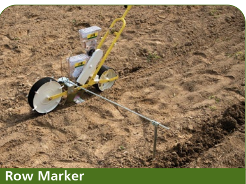
Product #:9078 Marks your next row.